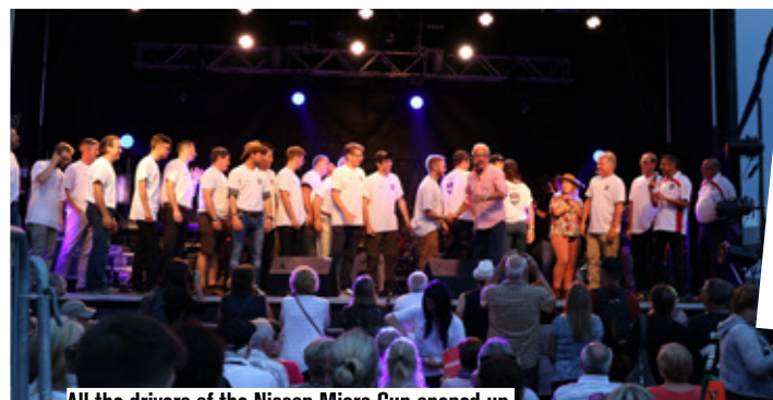
All the drivers of the Nissan Micra Cup opened up the show before leaving the stage to Michel Barrette.